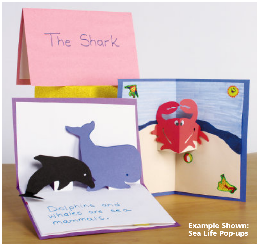
Example Shown: Sea Life Pop-ups