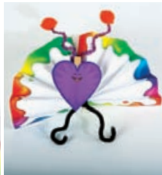
Detail of clothespin holder.