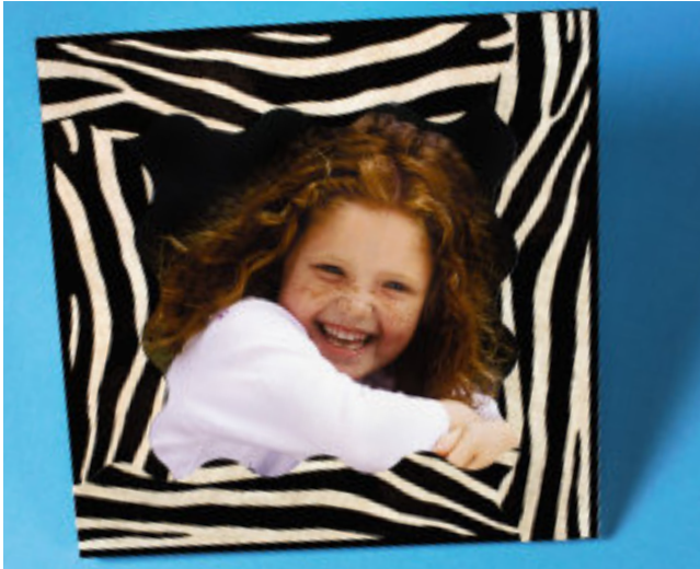
Zany Zebra Frames (Use T-92162 Zebra TERRIFIC TRIMMERS®) Bring out the wild side in any classroom! Perfect for framing student pictures, class work, announcements, or assignments.