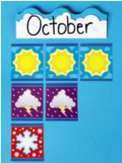
Weather Watch (Use T-85045 What's the Weather? BOLDER BORDERS®) Give young weather watchers a lesson in graphing. Cut apart each weather symbol and attach magnets or hook-and-loop tape to the back. Each morning, invite students to track the weather using one of the weather cards. Teach tally marking and other graphing techniques as the bar graph grows each day.