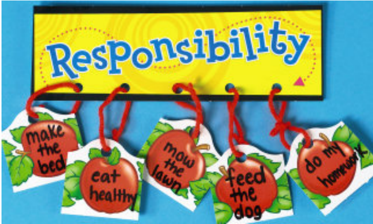
Character Mobile (Use T-85062 Character Education BOLDER BORDERS® and T-92056 Red Apples TERRIFIC TRIMMERS®) Put good character in motion. Cut apart each character trait on the border to make a mobile. Then, cut out apples from a section of trimmer and invite students to think of ways they can practice each trait and write these ideas on the apples. Hang the apples from the trait with yarn.