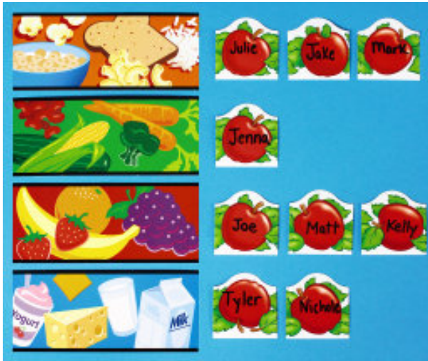
Food Pyramid Fun (Use T-85066 MyPyramid BOLDER BORDERS® and T-92056 Red Apples TERRIFIC TRIMMERS®) Encourage healthy eating habits by teaching the food pyramid. Cut apart the various food groups and attach a magnet to the back of each. Display on a whiteboard and use for graphing activities, such as tracking your students' eating habits.